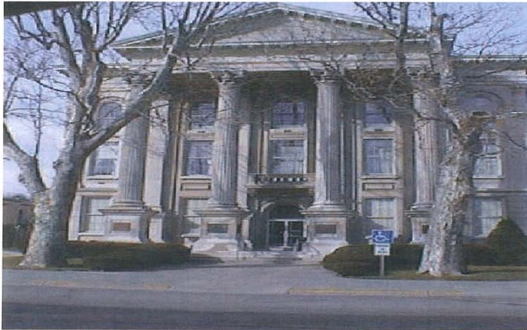
Dearborn County Court House