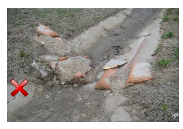
Routine inspections and maintenance are not taking place. Sediment buildup should be cleared, and missing bags replaced.