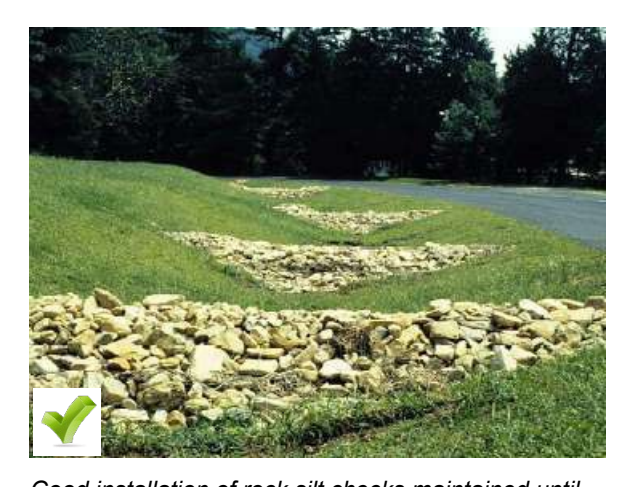
Good installation of rock silt checks maintained until the project is completely stabilized. Now that the site is stabilized, checks are ready for removal.