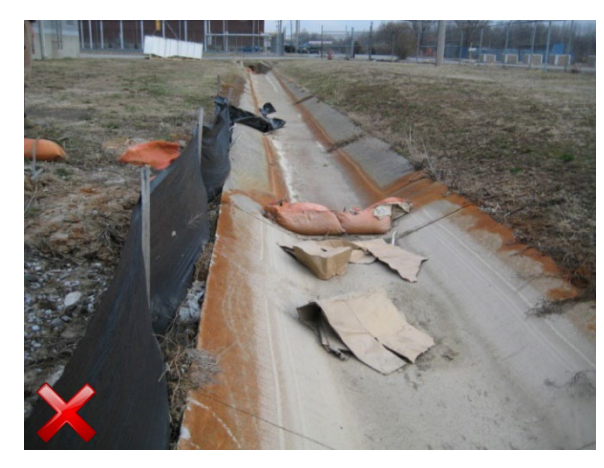
Poor installation of stone-filled bags to serve as check dam. Tied end of bag should be on the downstream end and the center should be lower than the sides.