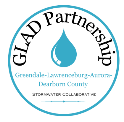
Brochure Content Sourced From: Southern Indiana Stormwater Advisory Committee https://www.siswac.org/

For more information, please visit www.dearborncounty.org