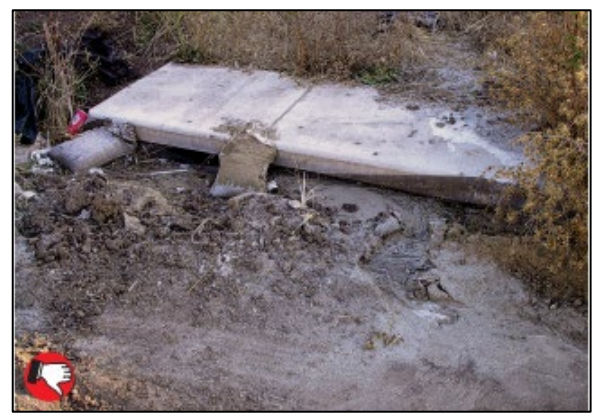
Poor placement and poor maintenance of stone bag inlet ponding dam. Accumulated sediment must be removed and dam should be repaired.