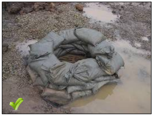
Stone-filled bags of either burlap or woven geotextile fabric should be used. Leave one bag gap in the top row to provide a spillway for overflow.

PROPERLY INSTALLED INLET PROTECTION KEEPS SEDIMENT AND TRASH OUT OF LOCAL WATERWAYS, INCLUDING STREAMS, RIVERS, AND LAKES, AND PROTECTS OUR ENVIRONMENT.