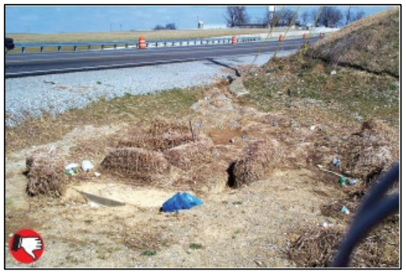
Example of poor inlet protection and inadequate maintenance.

Good application of silt fence frame to protect inlet. Use wire fence backing to reinforce frame, or diagonal bracing across top of stakes. Make sure fence is trenched in to prevent bypasses or undercutting. Inspect and remove sediment as necessary after each rain. Expect a more frequent replacement schedule for silt fence drop inlet protection.