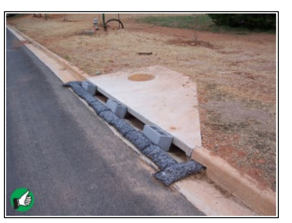
Excellent use of rock-filled mesh tubes to control sediment at curb inlet. Concrete block spacers keep tubes from moving into - and clogging - the inlet during heavy flows.

PROPERLY INSTALLED INLET PROTECTION KEEPS SEDIMENT AND TRASH OUT OF LOCAL WATERWAYS, INCLUDING STREAMS, RIVERS, AND LAKES, AND PROTECTS OUR ENVIRONMENT.