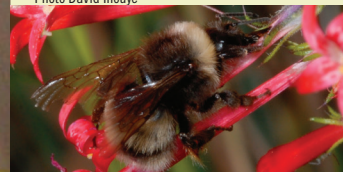
Western bumble bee, Bombus occidentalis