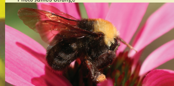
Franklin bumble bee, Bombus franklini