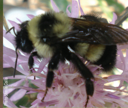
Rusty-patched bumble bee, Bombus affinis

Currently, the Common Eastern bumble bee ( Bombus impatiens ) is the only species being commercially reared for pollination services in North America, despite the fact that it is only native to the eastern U.S. and Canada.