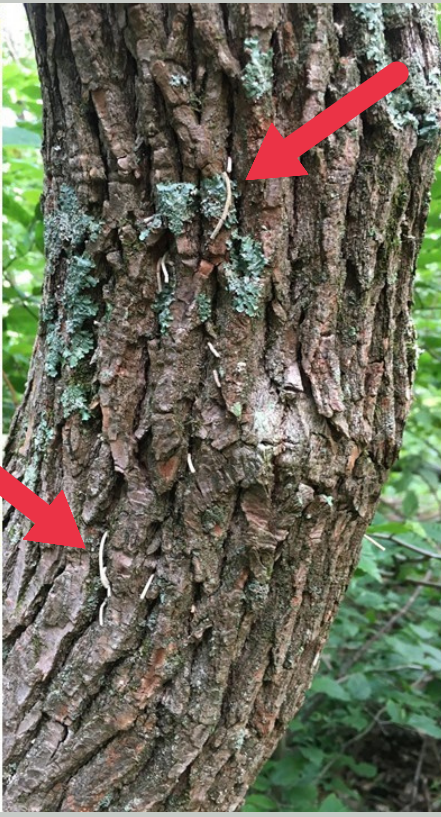
"Noodles" from beetle activity