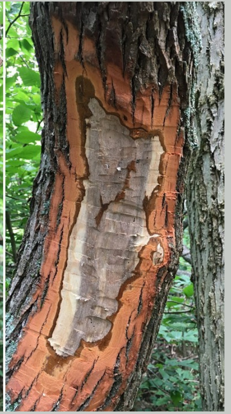
Staining under the bark