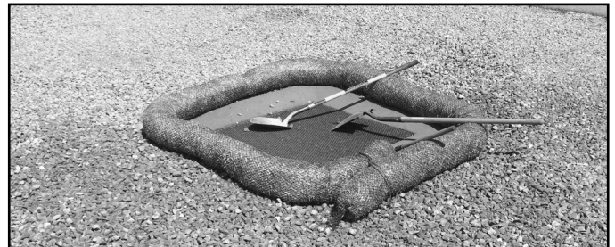
Drop inlet protected with coir log

2015 saw 12 new construction projects that consisted of road improvements, borrow areas, commercial development and utility improvements. By implementing Rule 5 in Dearborn County the potential of erosion and sedimentation is minimized by around 49,000 tons per year.