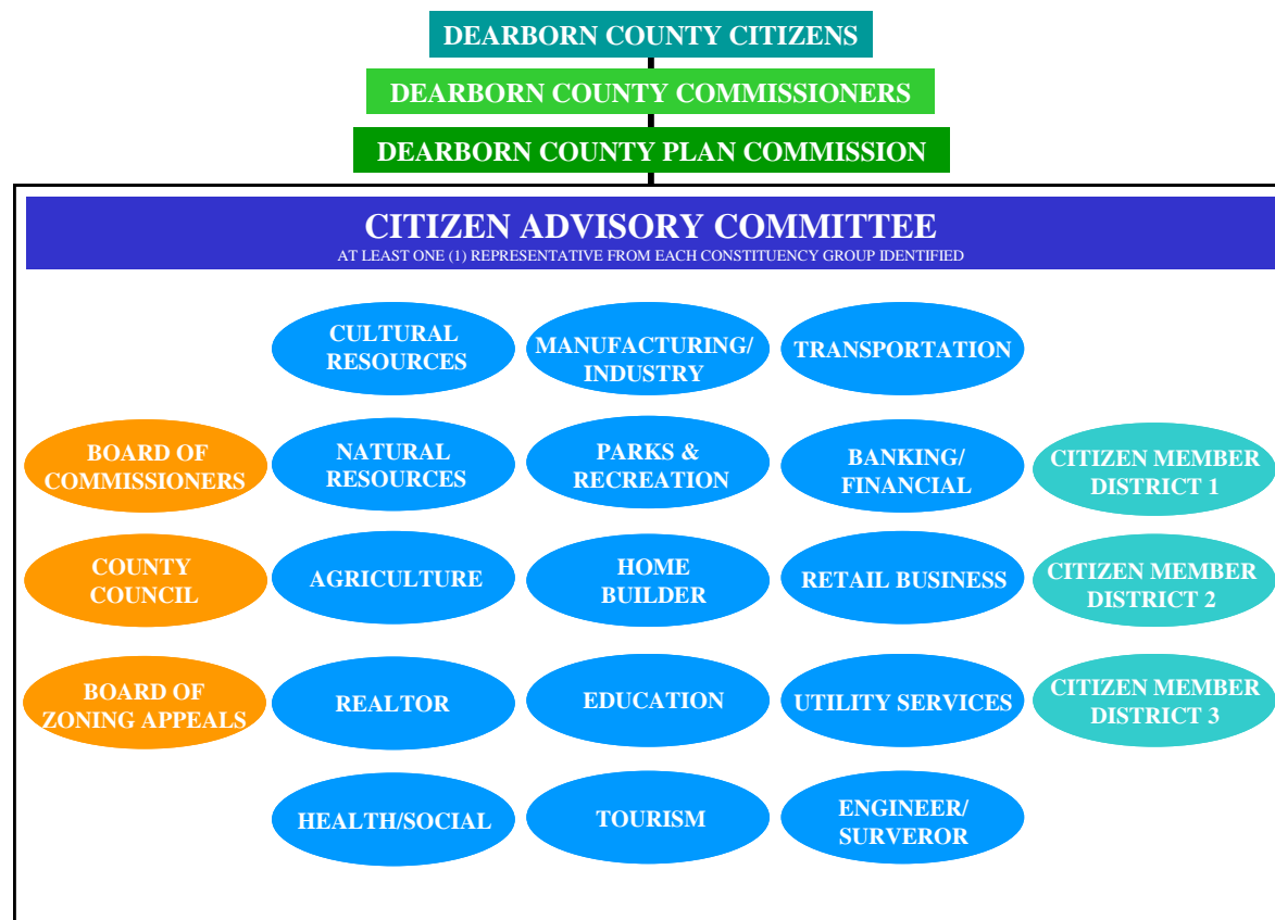
Figure 1-2: Advisory Committee Framework

The first method of inviting community involvement to this process was to formulate an Advisory Committee. Citizens with various backgrounds were selected to represent the specific constituency groups listed in Figure 1-2. These representatives were solicited by the Plan Commission through a series of public forums.