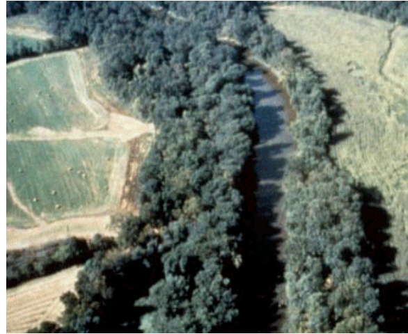
USDA Natural Resources Conservation Service

A riparian zone can be described in many ways, but is essentially the narrow strip of transitional land between upland habitats and perennial or intermittent bodies of water, including creeks, streams, rivers, wetlands and lakes. A healthy riparian system supports a great diversity of upland and wetland-adapted plant species and provides habitat for both wildlife and aquatic organisms. Although they often comprise only a small percentage of total land area, riparian zones represent a vital element in the overall landscape, acting as both a buffer and an ecological link between water-based and land-based ecosystems.