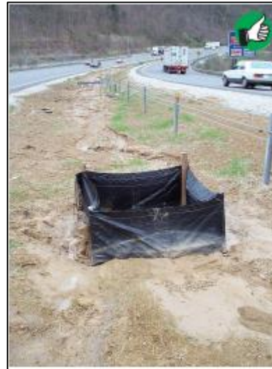
Good application of silt fence frame to protect inlet. Use wire fence backing to reinforce frame, or diagonal bracing across top of stakes. Make sure fence is trenched in to prevent bypasses or undercutting. Inspect and remove sediment as necessary after each rain. Expect a more frequent replacement schedule for silt fence drop inlet protection.