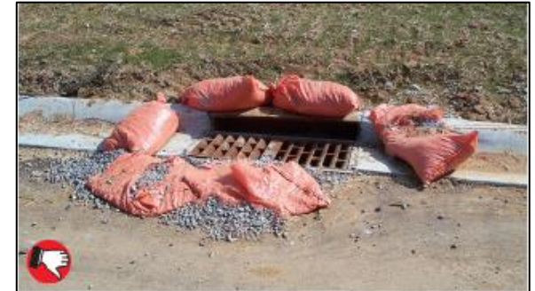
Poor placement of stone bag inlet dam. Bags work well if used properly and maintained. Bags must form a dam around the inlet with no large gaps.