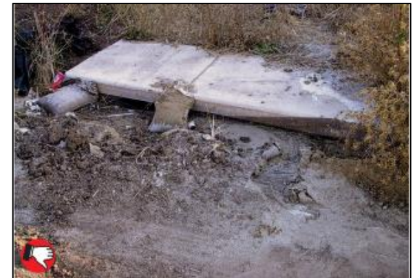
Poor placement and poor maintenance of stone bag inlet ponding dam. Accumulated sediment must be removed and dam should be repaired.