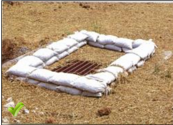
Inlet protection berm construction of half-filled stone bags. Use #57 rock, overlap bags to eliminate large openings and rapid flow-through.