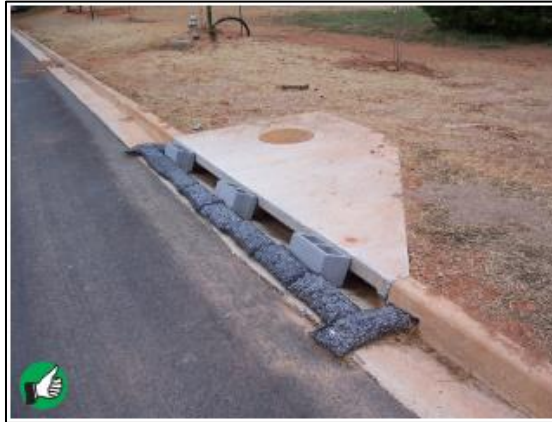
Excellent use of rock-filled mesh tubes to control sediment at curb inlet. Concrete block spacers keep tubes from moving into - and clogging - the inlet during heavy flows.