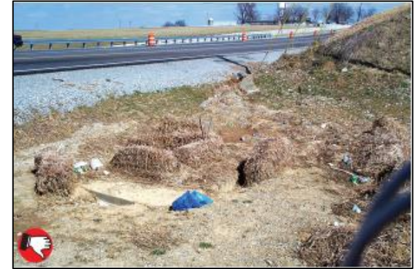
Example of poor inlet protection and inadequate maintenance.