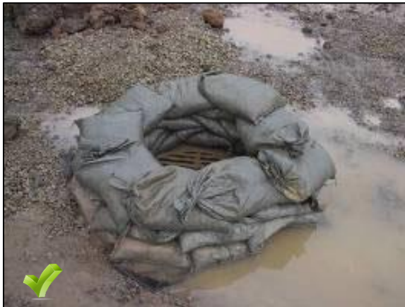
Stone-filled bags of either burlap or woven geotextile fabric should be used. Leave one bag gap in the top row to provide a spillway for overflow.

PROPERLY INSTALLED INLET PROTECTION KEEPS SEDIMENT AND TRASH OUT OF LOCAL WATERWAYS, INCLUDING STREAMS, RIVERS, AND LAKES, AND PROTECTS OUR ENVIRONMENT.